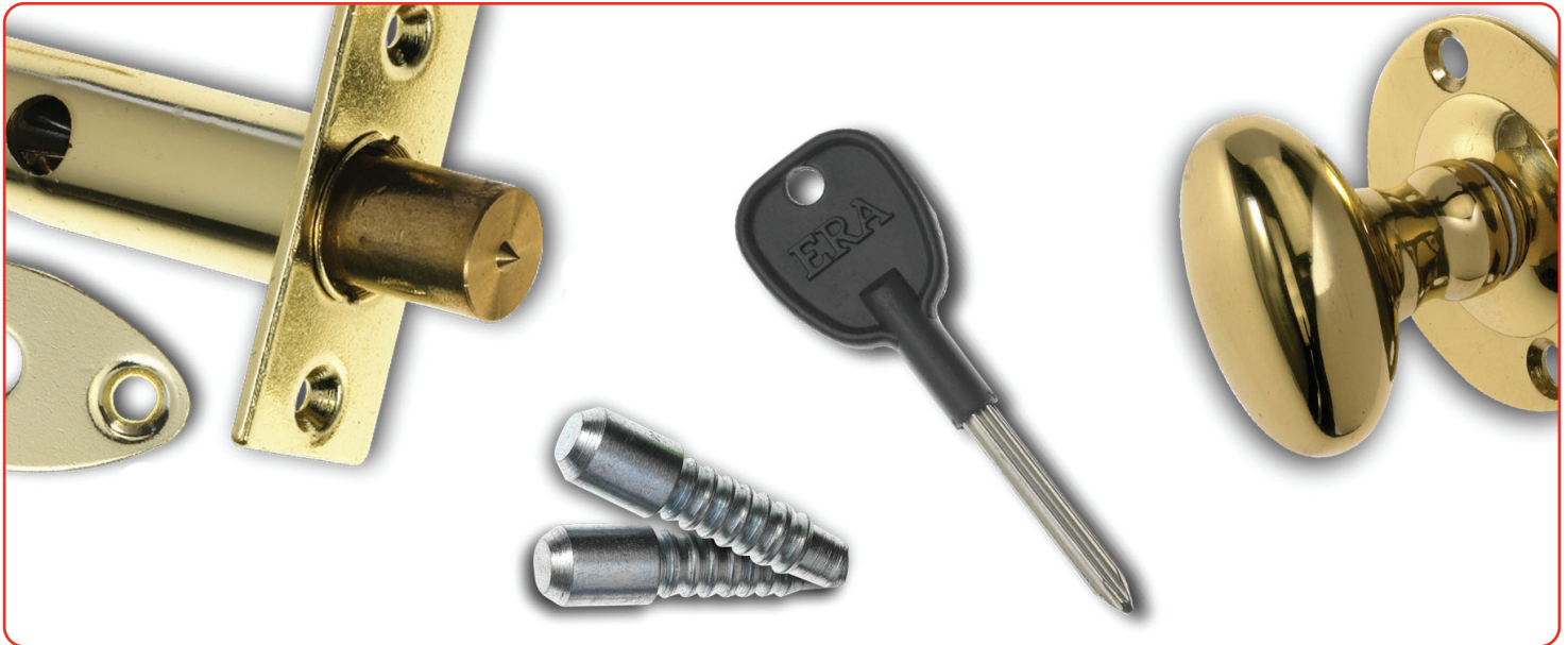
Door Security Bolt